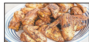
Plain Party Chicken Wings 12/3.99