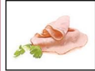
Freshly Sliced Krakus Ham 5.99 LB