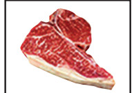
U.S.D.A. Gov. Inspected Porterhouse Steak 6.99 LB