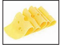
Domestic Swiss Cheese 4.99 LB