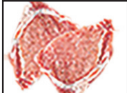
Boneless American Cut Pork Chops Family pack 2.49 LB