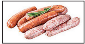
Angelo's Fresh Home Made, Italian Sausage, Polish Sausage, Brats, And Chorizo 2.99 LB