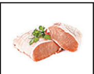
Boneless Pork Roast 2.29 LB