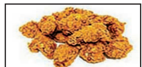
Angelos Famous Chicken 8 PCS 2 of each. 2 breasts, 2 legs, 2 thighs & 2 wings Fried Or Greek Style Roasted 6.99