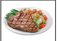
U.S.D.A. Gov. Inspected T-Bone Steak 6.49 LB