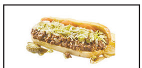
Come In And Try Our Italian Beef Sandwich, Best In Town! 3.49 LB