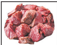
U.S.D.A. Choice Boneless Beef Stew 5.99 LB