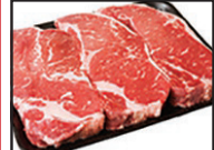
U.S.D.A. Choice Boneless Strip Steak 8.99 LB