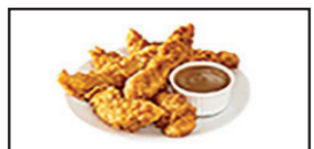
Extra Large Chicken Tenders Free Ranch Dressing 4/5.00