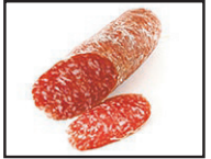
Primo Genoa Salami 3.49 LB