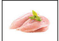
Fresh Boneless Skinless Chicken Breast Family pack 1.99 LB