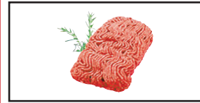
Fresh Ground Chuck 3 Lbs Or More 3.49 LB