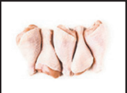
Fresh Chicken Drumsticks .69 LB